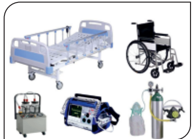
Medical surgical equipments on Sale/Rent Basis