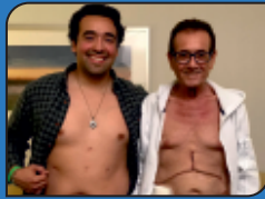
Post Liver Transplant Care At Home