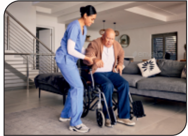
Physiotherapy Home Visit Services