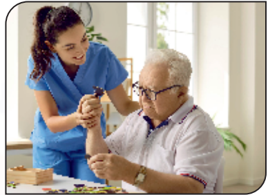
Dementia & Alzheimers Care At Home