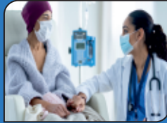
Cancer Patient Care At Home