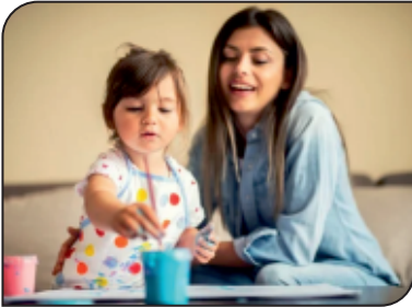
Aayas & Baby Sitters