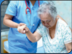
Hip & Knee Replacement Care At Home