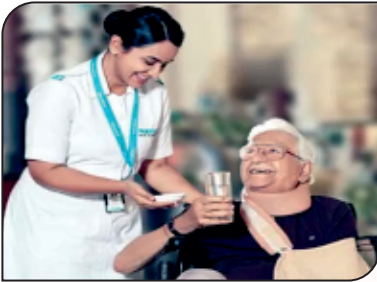
Nurses & Patient Caretakers (Ward Boys) At Home