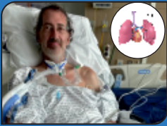
Post Lungs Transplant Care At Home