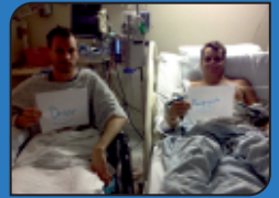
Kidney Transplant Care At Home