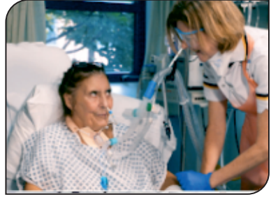
Tracheostomy Care At Home