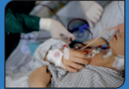
Home I.C.U. Nurses